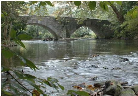
From Penn's Woods newsletter, TNC PA Chapter

From Penn's Woods, The Nature Conservancy