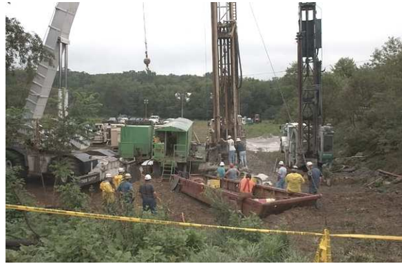
Drilling the Rescue Shafts

The third anniversary celebration for the Quecreek Mine Rescue will begin at 9:30