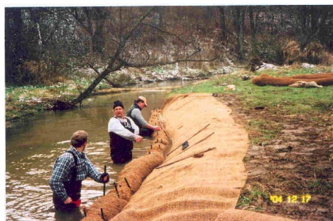
Installing fiber mat to help stabilize Rocky Run stream bank. See the special photo feature at the bottom of this webpage.

He started his business after getting practical experience in the Ohio Natural Areas and Preserves Program and working for a consulting firm in Pennsylvania that had its own native plant nursery.