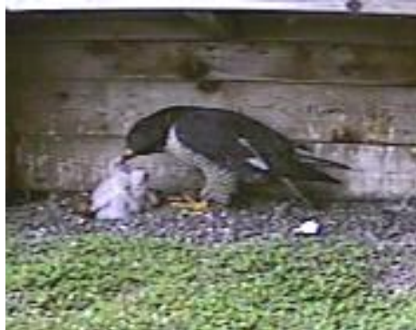
Feeding frenzy in Pittsburgh.

Although counting your "chickens" before the eggs are hatched is usually a bad idea, the Peregrine Falcon eggs in the nest on the Rachel Carson Building in Harrisburg usually hatch right on schedule, about May 8 this year.